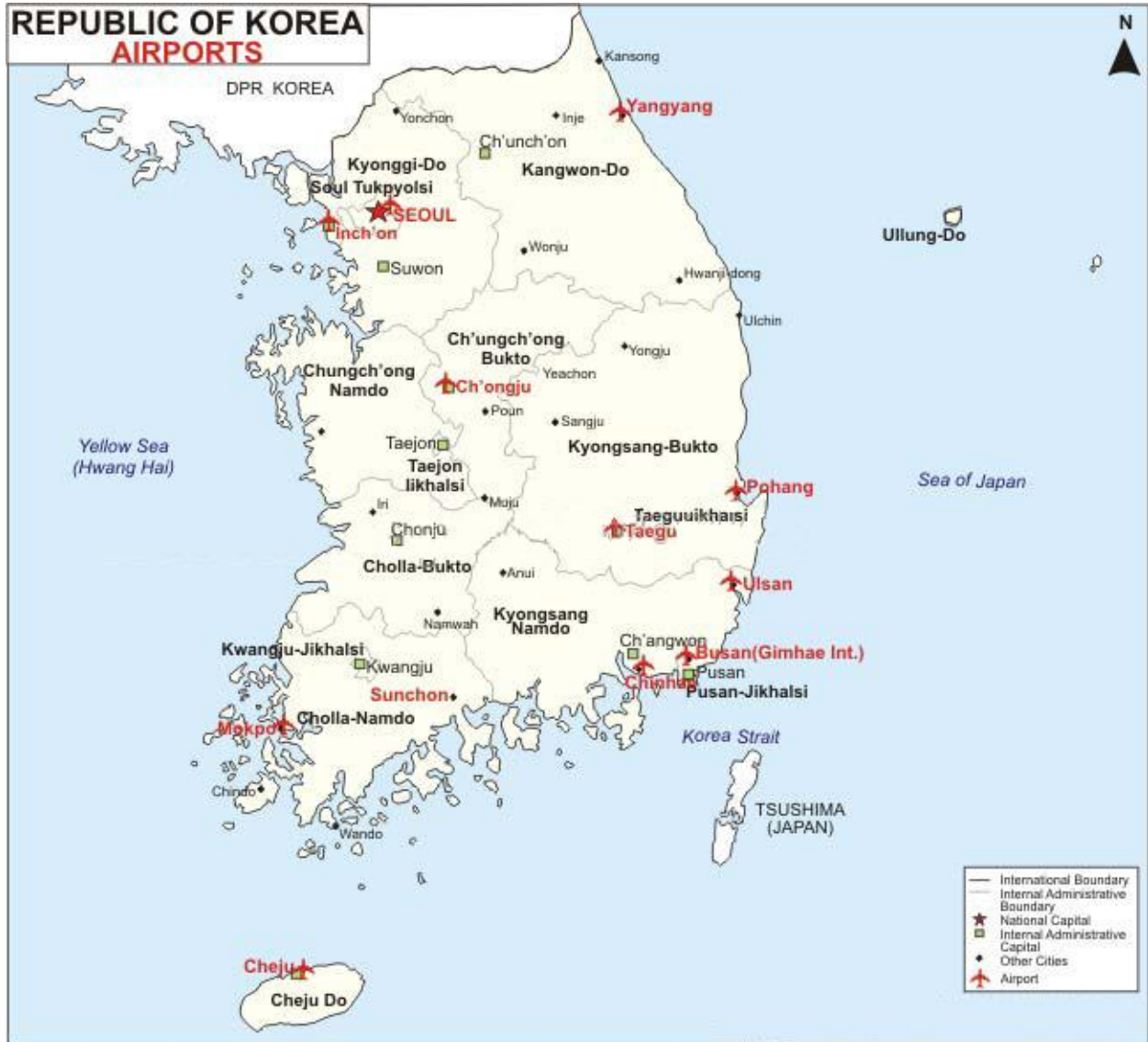
Map not for publication